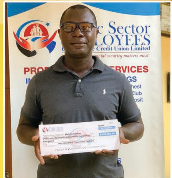
Melvin Tucker Leroy Burnett Memorial Scholarship